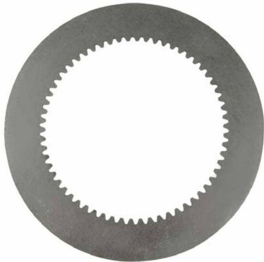
Alto # 306737-240