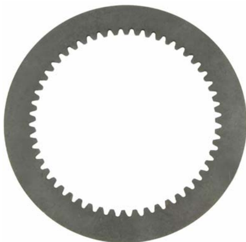
Alto # 306739-210