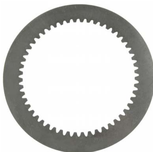
Alto # 306735-240