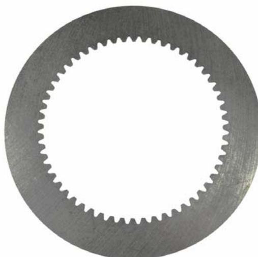
Alto # 306737-262