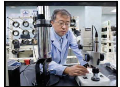
Research and Development Center