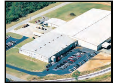
200,000 ft 2 facility in Atmore, AL

Alto Products Corp. is the oldest and largest independently owned and operated manufacturer of clutches, brakes and gears for Automatic, Power-Shift and Standard Transmissions in the world. We specialize in the complete design and manufacturing of bonded friction materials, stamped steel separator reaction discs, brake bands, gasket & seal kits. Our capabilities include bonding, stamping, gear cutting, engineering, in-house tooling and design services. Alto has manufactured more than a billion clutches over the last 50 years. manufacturing and distributing begins at the corporate offices in Atmore, AL. Distribution facilities are located throughout North America in New Jersey, Los Angeles, Miami, Toronto and Mexico City. Export sales are handled by the Latin American Headquarters in Miami and supported by sales offices in Germany, Australia and Brazil