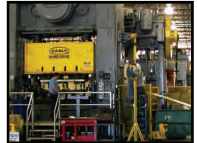
Alto's Clutch Manufacturing Plant