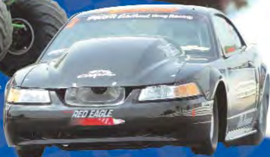
Joel Graathouse 2003 Pro Edelbrock Super Street Champion & Record Holder